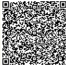
The Old Town Hall