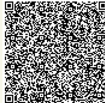
St. Mary's Basilica